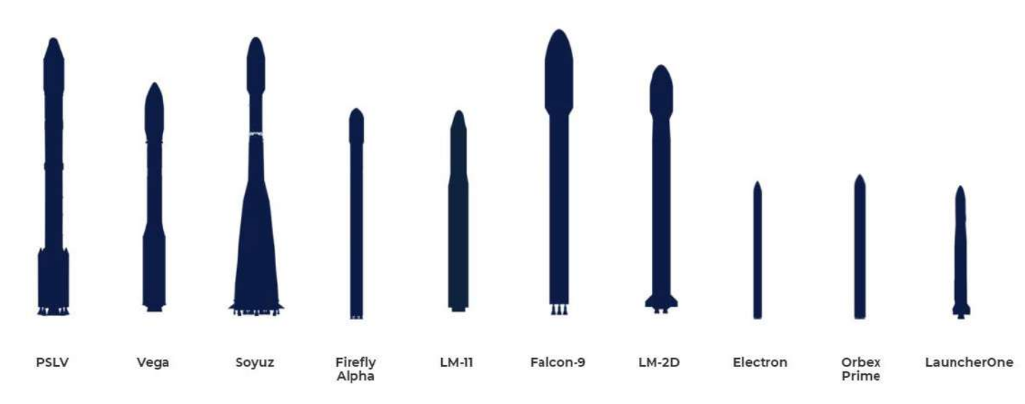
*other options are available on request

We are proud to have provided services on numerous launch vehicles around the world. We are also continuously expanding our portfolio of launch vehicles and are actively working together with small launch vehicle developers to increase access to space for our customers. We can help you get onto any vehicle that you want.